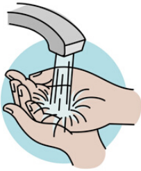
1. WET HANDS