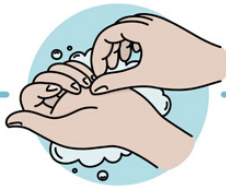
5. ...AND UNDER NAILS.