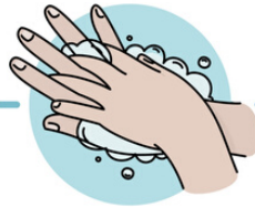
4. ENSURE AREA BETWEEN FINGERS IS CLEAN...