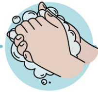
3. SCRUB HANDS FOR ABOUT 20 SECONDS