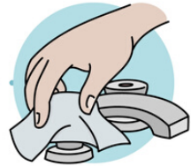
8. AVOID TOUCHING TAP. USE SAME PAPER TOWEL.