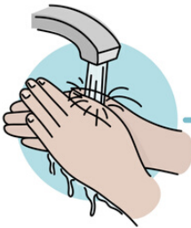
6. RINSE HANDS