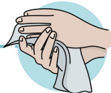
7. DRY WITH SINGLE USE PAPER TOWEL