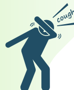
Use flexed elbow or tissue

Call (0)596 030 004 to book an appointment when you have any of the above symptoms