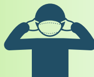
Avoid sick people